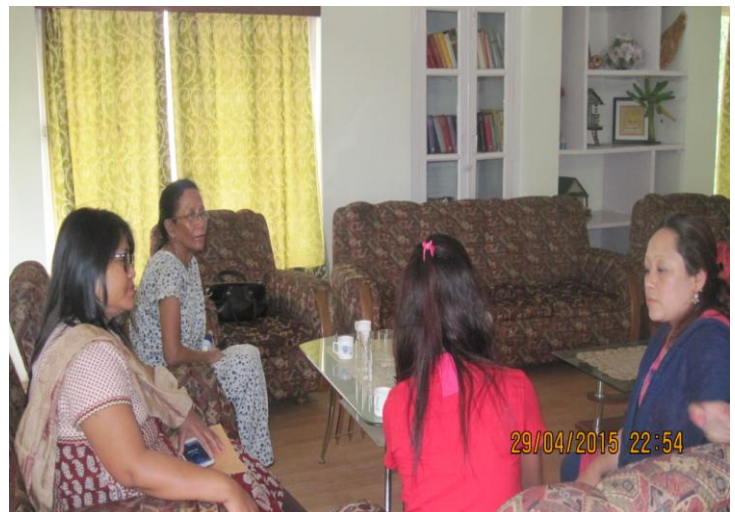
Follow up on the cases of tortured girls at Tura