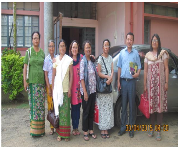
Meeting with members of NGOs at Resubelpara