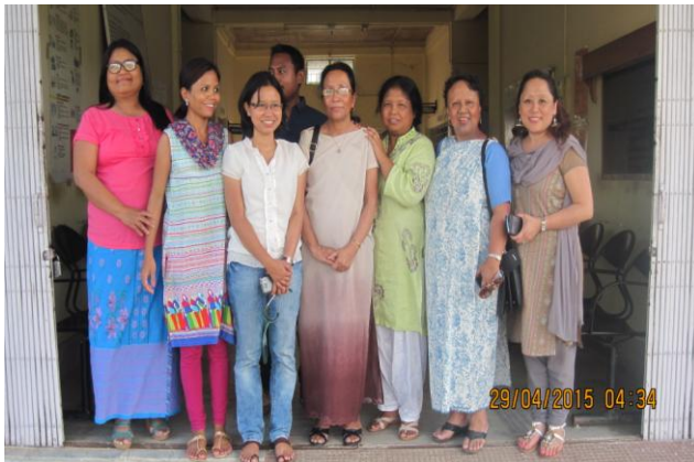
Doctors and Members of the Commission at Baghmara