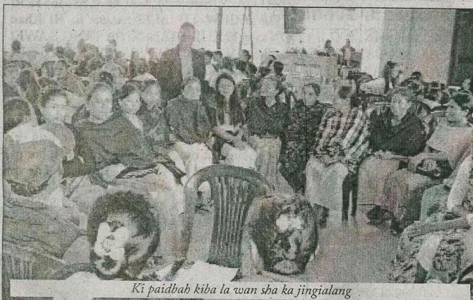
Ki paidbab kiba la wan sha ka jingialang