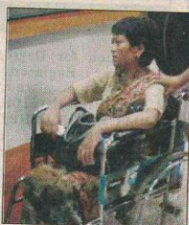
An injured woman is taken to Shillong Civil Hospital after the police lathicharge in the city on Friday.

While the police have maintained that the HYC