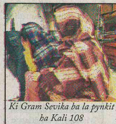
Ki Gram Sevika ba la pynkit ha Kali 108