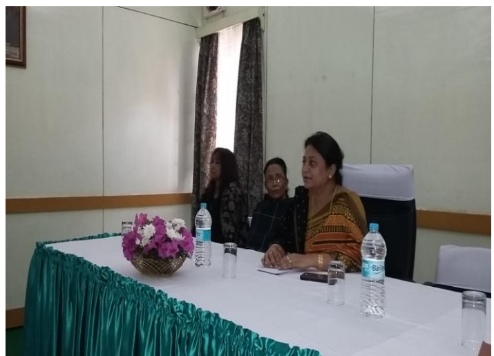
TRAINING OF SURVEYORS